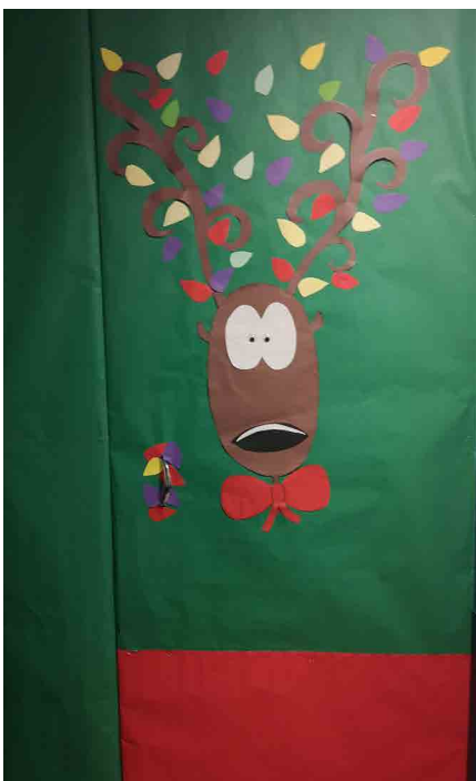
School Room 5