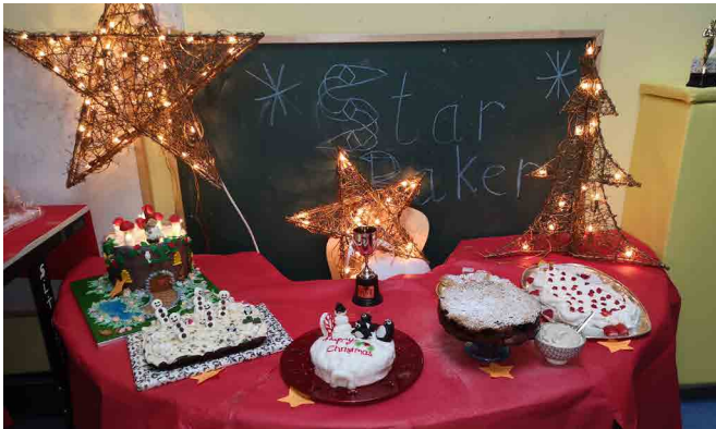
The Star Baker competition