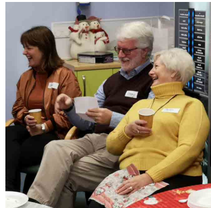
Grandparents and staff enjoying some Christmas treats