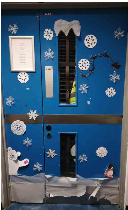
School Room 2