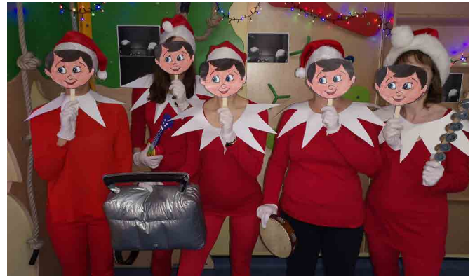
Elves on the shelf! Speech and Language