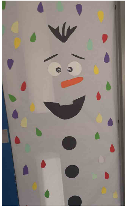
School Room 1