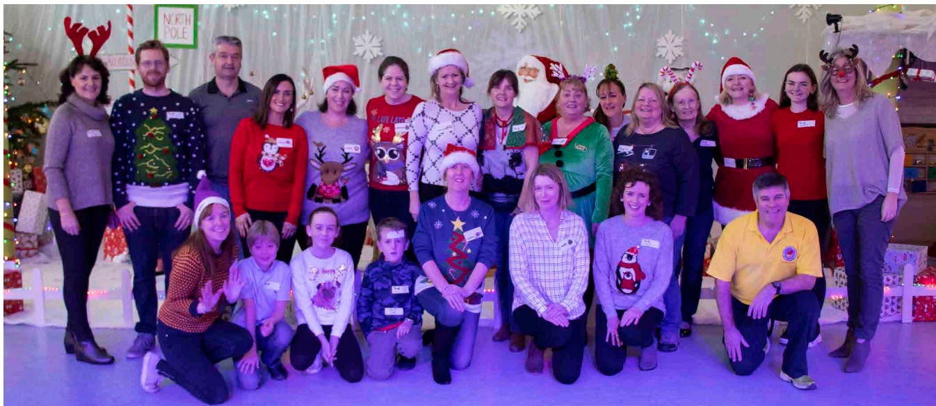
The CRC's team of Elves