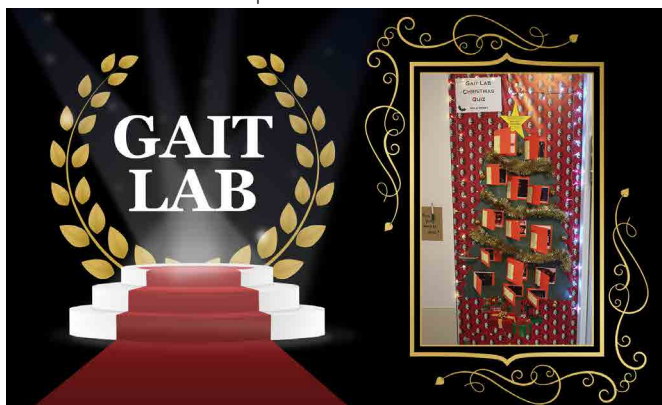
Best Interactive Door