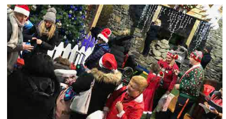
Everyone enjoying the nice trip to Lullymore