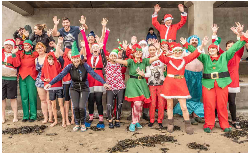
The brave souls from Scoil Mochua and Colin Bell

The event was to raise money for a whole school trip to Lullymore which took place on December 14th. Just over €4,500 was raised by staff and parents to bring 65 pupils, 70 staff members, 10 parents on 16 buses on a special trip to see Santa at Lullymore.