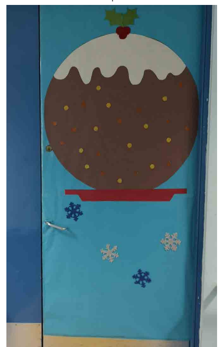
School Staff Room