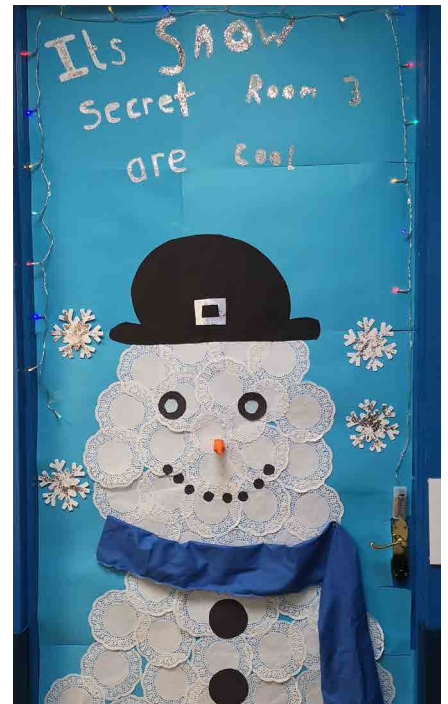
School Room 3