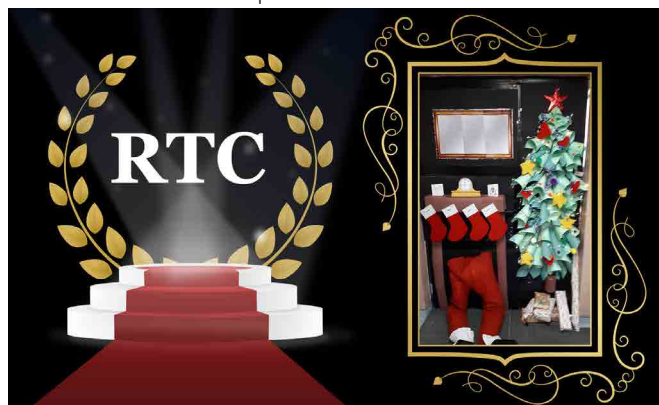
Best Festive Door