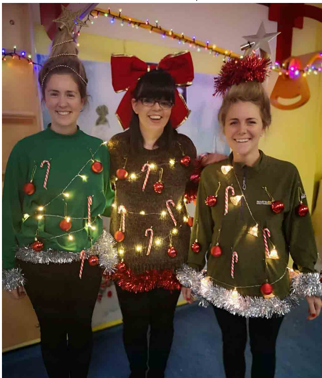
The School Age Team