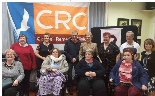
Some of the Firhouse team behind the project