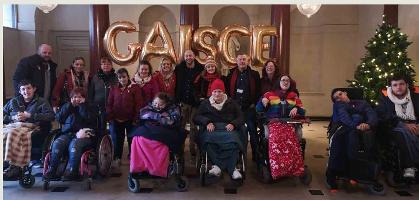
Members of the Transition Programme meeting the President

Members of our CRC Transition Programme had a very special request from Gaisce to form part of a Guard of Honour for President Higgins at the Gaisce Gold Ceremony in Dublin Castle, Monday 10th December. President Higgins and his wife Sabina stopped to chat to our students and commended them on their own achievements in attaining their Gaisce Bronze and Silver awards.