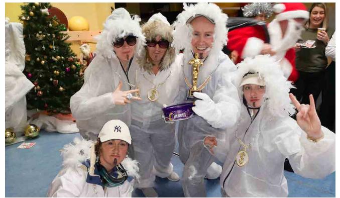
The Winners! Gait Lab as East 17