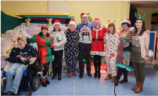
The Accounts Team

There was some serious competition for Best Christmas theme dress-up but the outright winners were East 17 AKA the Gait Lab!