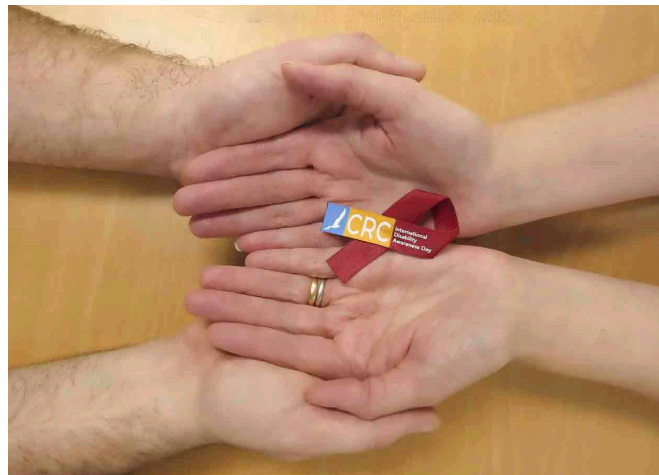
The CRC Ribbon