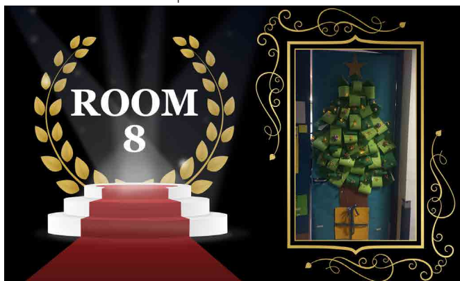
School Spirit of Christmas Award