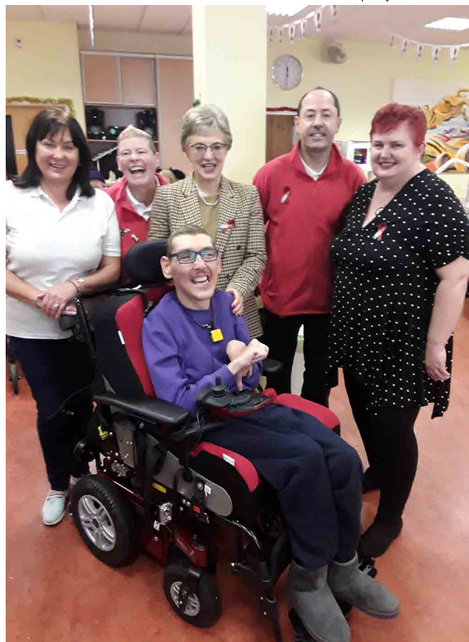
Minister for Children and Youth Affairs, Katherine Zappone, visits Firhouse