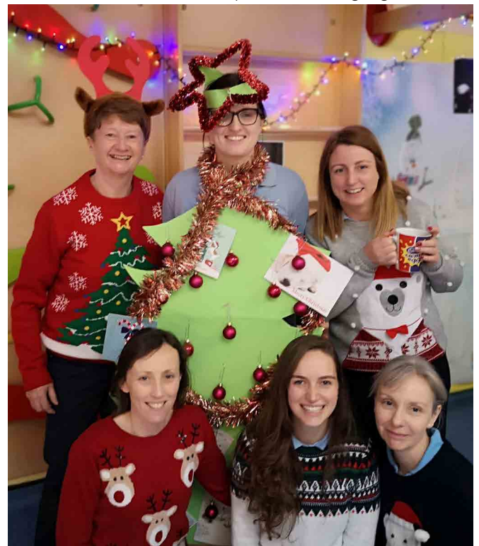
The Physiotherapy team