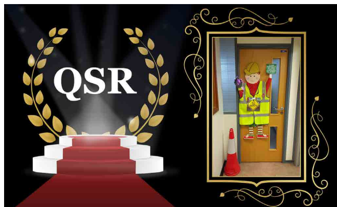
Best Christmas Work Related Door