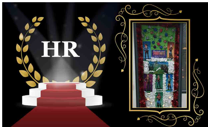
Best Creative Door