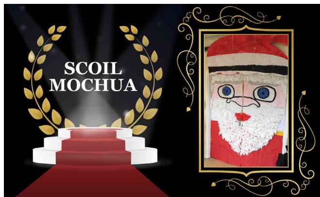
School Spirit of Christmas Award