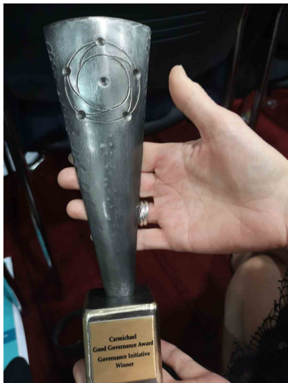
The Good Governance Award

The award was in recognition of the CRC stakeholder engagement programme ‘Keeping Connected’ which sets out to identify opportunities to get greater impact from Board engagement with key stakeholders. The ‘Keeping Connected’ agenda item is an interactive presentation which enables clients and the staff to meet and engage with the Board and to communicate in a forum that is welcoming, direct, challenging and responsive. It gives a voice to all corners of the organisation to its highest level and is a great opportunity for real partnership.