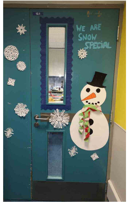
School Resource Room