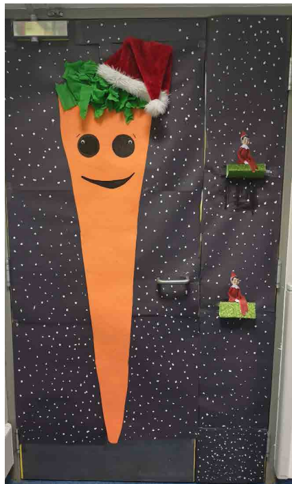
School Room 14