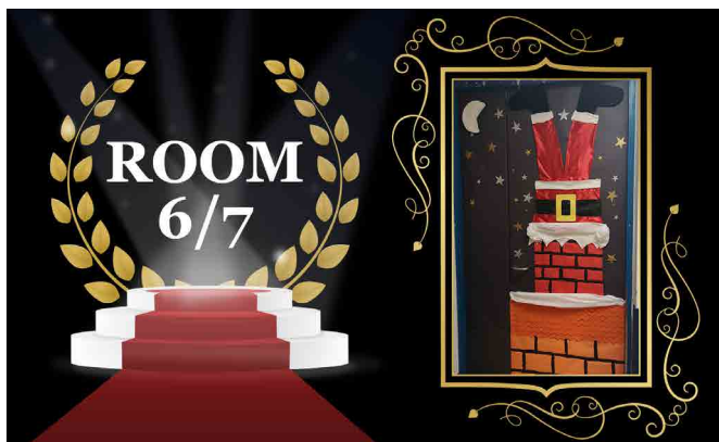
School Spirit of Christmas Award