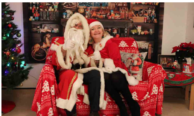
Santa Claus and Mrs Claus