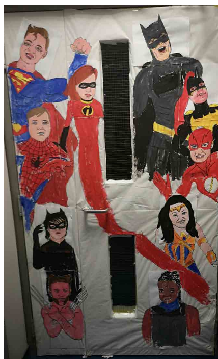
School Room 16