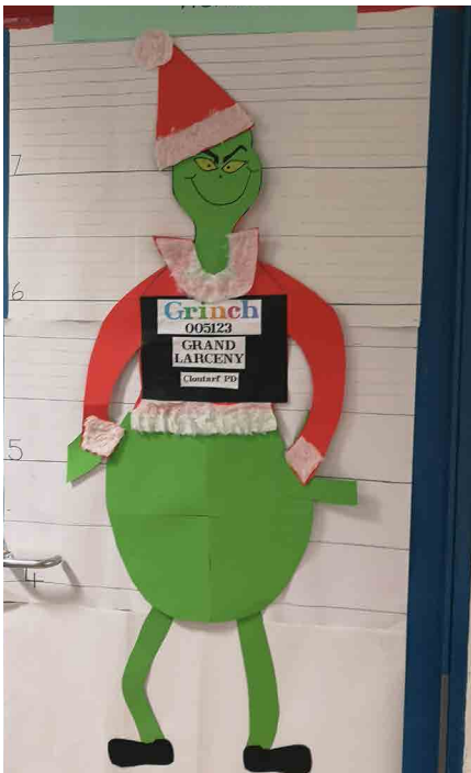
School Room 10

The winners were announced at a prize-giving ceremony at the Christmas Staff Lunch and trophies were awarded to all category winners.