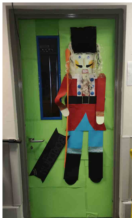
School Music Room