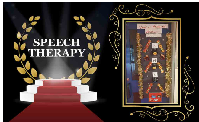
Best Technical Door