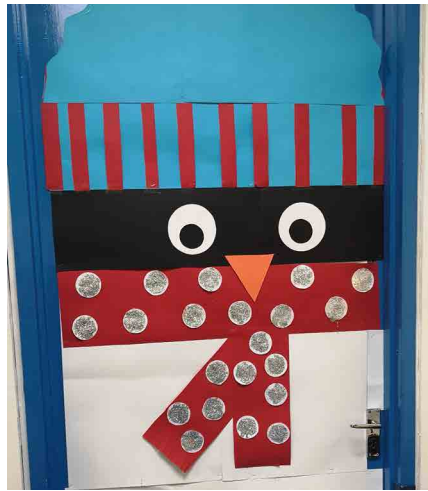
School Room 4