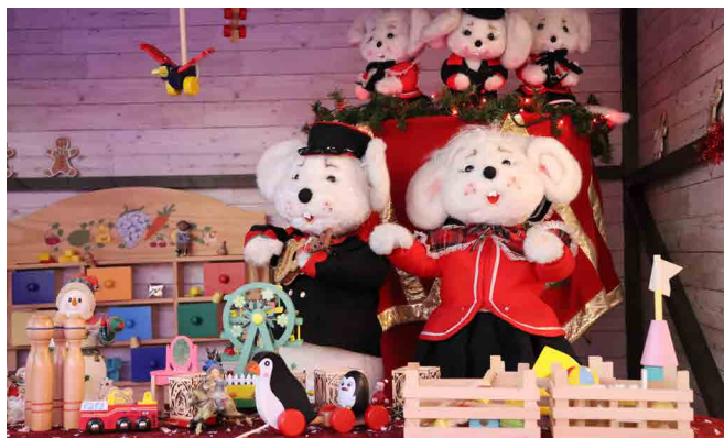
The wonderful winter wonderland created by ATSS