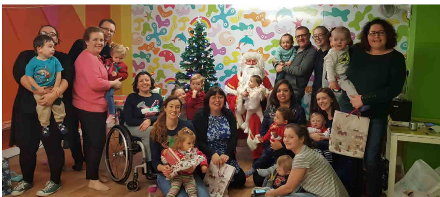
Parent and Toddler Group with Santa

The Parent and Toddler group had a fantastic day out filled with fun and games in Malahide Play Centre. Even Santa Claus stopped by to join in the fun.